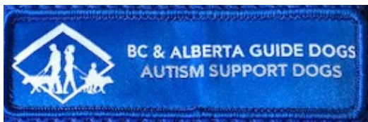
BC & Alberta Guide Dogs